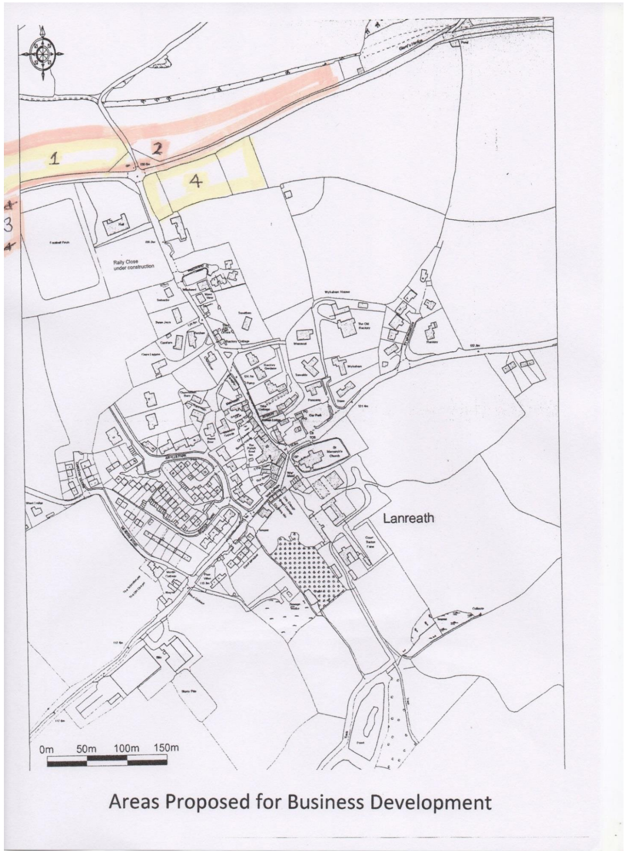
Areas Proposed for Business Development